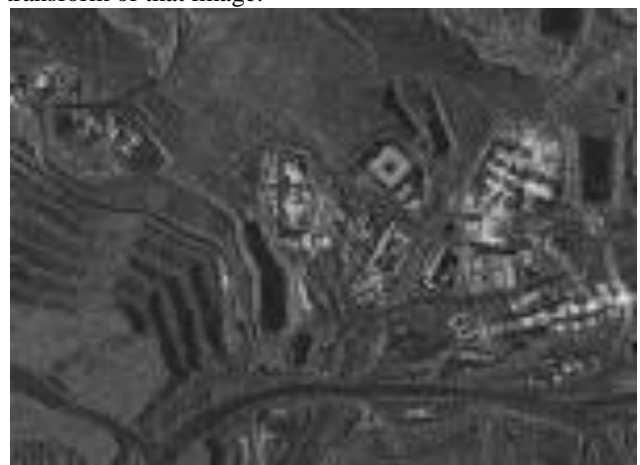
Fig 1. reconstructed SAR IMAGE with proposed method